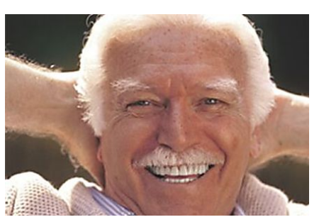
Beautiful 55+ Senior Communities retirementlivingfind.com