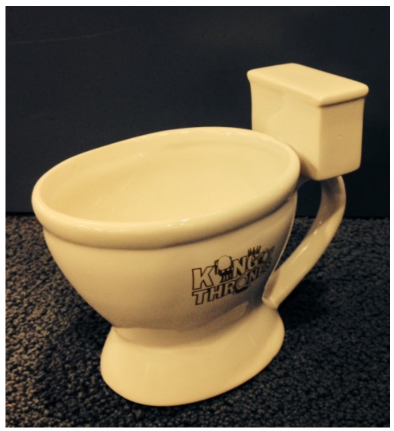
You have a golden opportunity to win this lovely mug, this week's second prize.