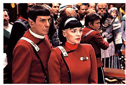
9 Celebrities You Didn't Realize Were on Star Trek